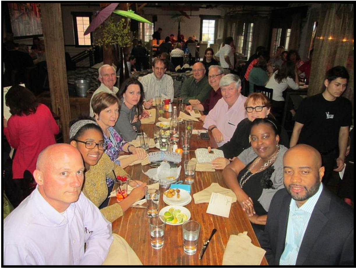
Master of Arts in Organizational Leadership Cohort Washington, D.C. April 2015