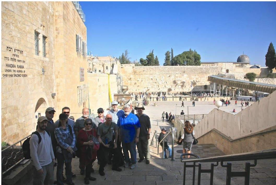
MAOL in Israel February 2016

Accreditation by TRACS (Transnational Association of Christian Colleges and Schools) was effective March 20, 2002 and was renewed in 2008 for ten years. The Board of Trustees chose to discontinue the relationship in June 2009. Accredited Status with ABHE (Association of Biblical Higher Education) (formerly the Accrediting Association of Bible Colleges, AABC) was approved on February 23, 2007. On February 11, 2013, the College received reaffirmation of accreditation with ABHE until 2022. Being accredited enables the college to offer Federal financial aid programs.