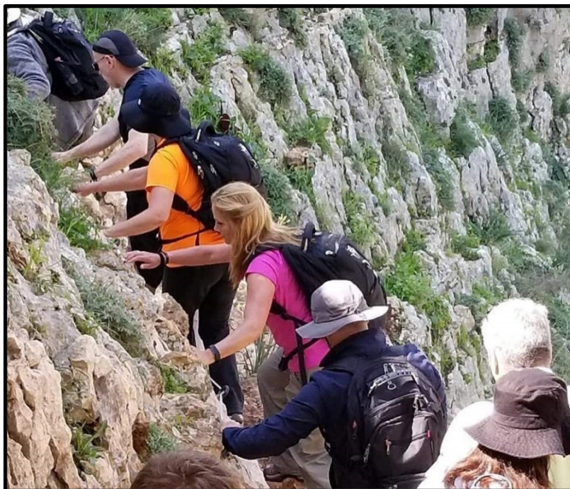
MAOL Cohort Jericho - Israel