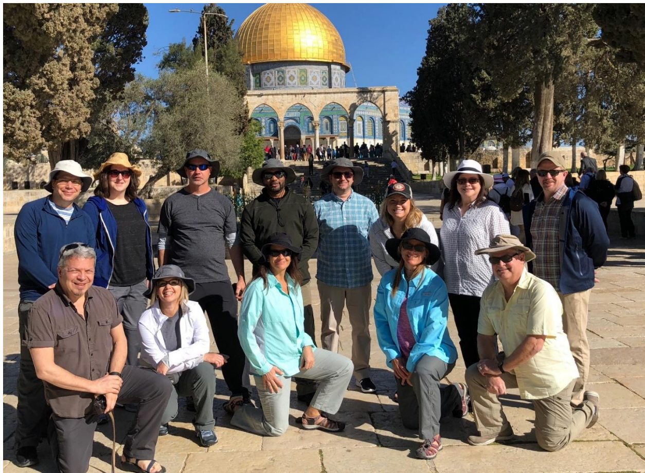
Masters of Arts in Organizational Leadership Biblical Study Trip to Israel – Spring 2018

Missiology - In the 21st century churches and faith-based institutions are faced with increasing global challenge in delivering their mission to diverse and, sometimes, adversarial cultures. The equipping of leaders and managers in intercultural communication is vitally critical in effectively organizing for the accomplishment of mission. This ability is no longer reserved for individuals and organizations traveling abroad. In a global community, the world has been brought to our doorstep. The possession of multi-cultural understanding is indispensable.